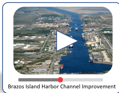
Brazos Island Harbor Channel Improvement