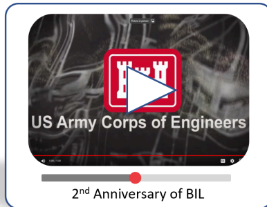
2 nd Anniversary of BIL