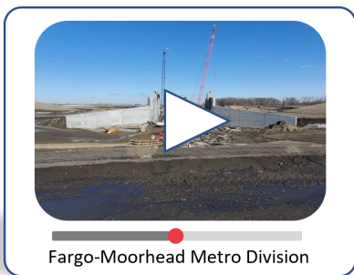
Fargo-Moorhead Metro Division