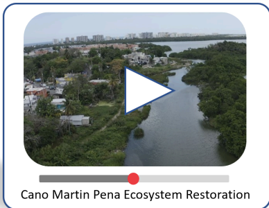
Cano Martin Pena Ecosystem Restoration