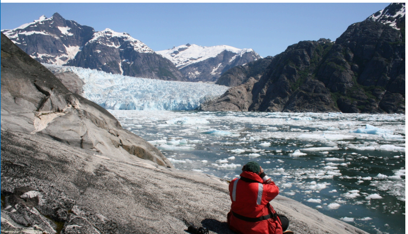
FML harbor seal researcher Dave Withrow conducts a seal count during a harbor seal pupping survey.