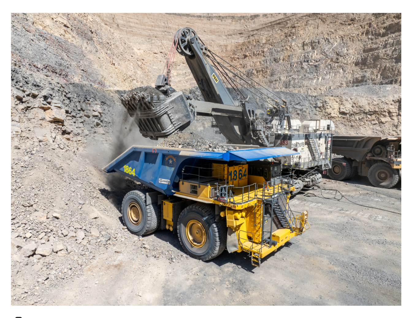
An electric shovel loading haul trucks at Nevada Gold Mines's open pit mining operations