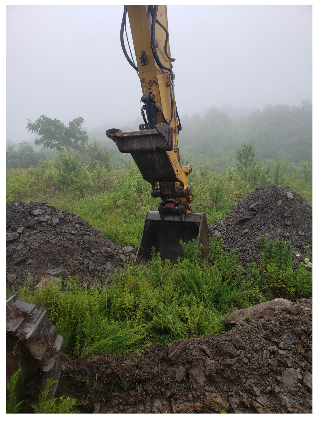
Geotechnical investigations at the Lewis Ridge Pumped Storage Project site