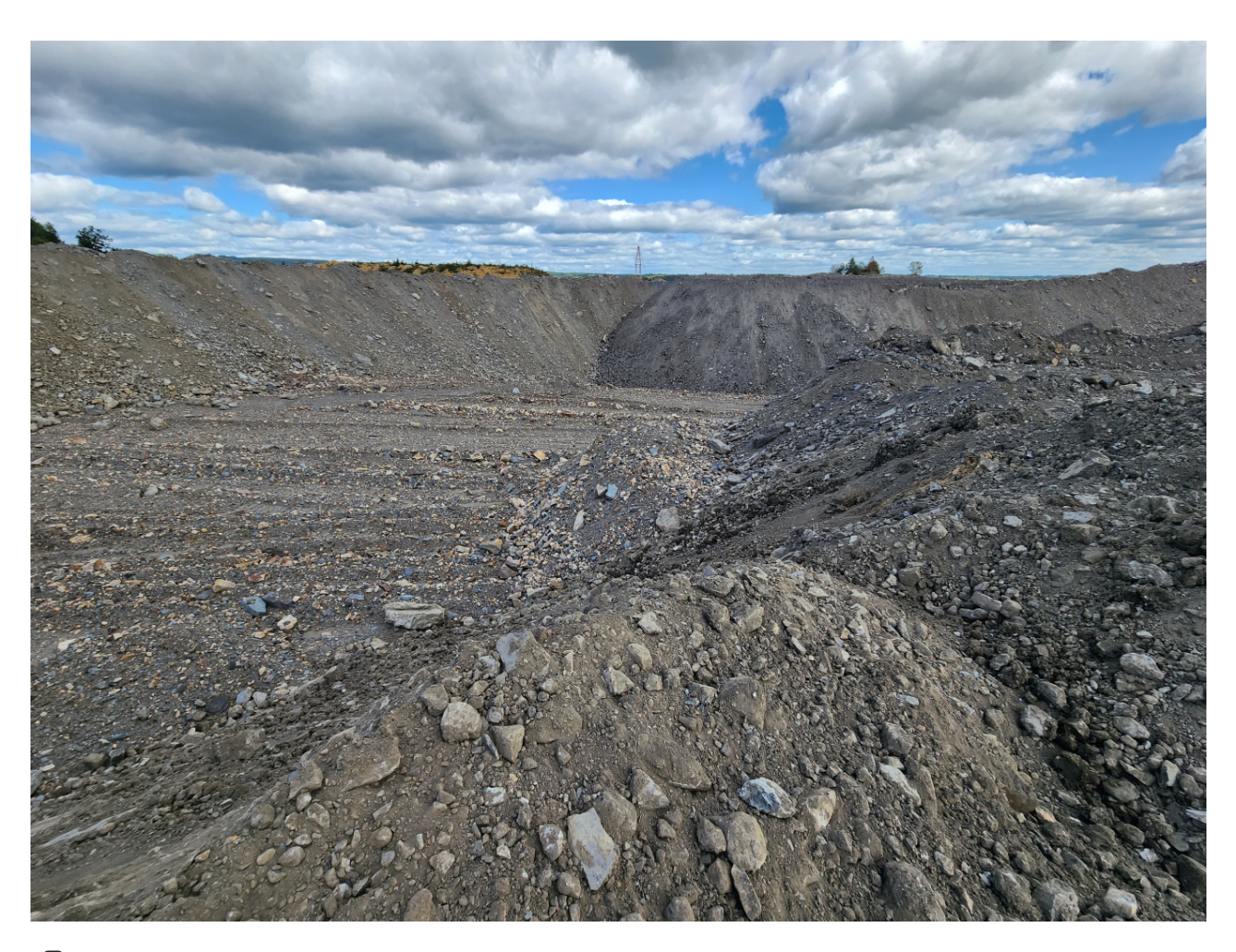
Mid-stage pit being filled for reclamation on the Shaw 2 site