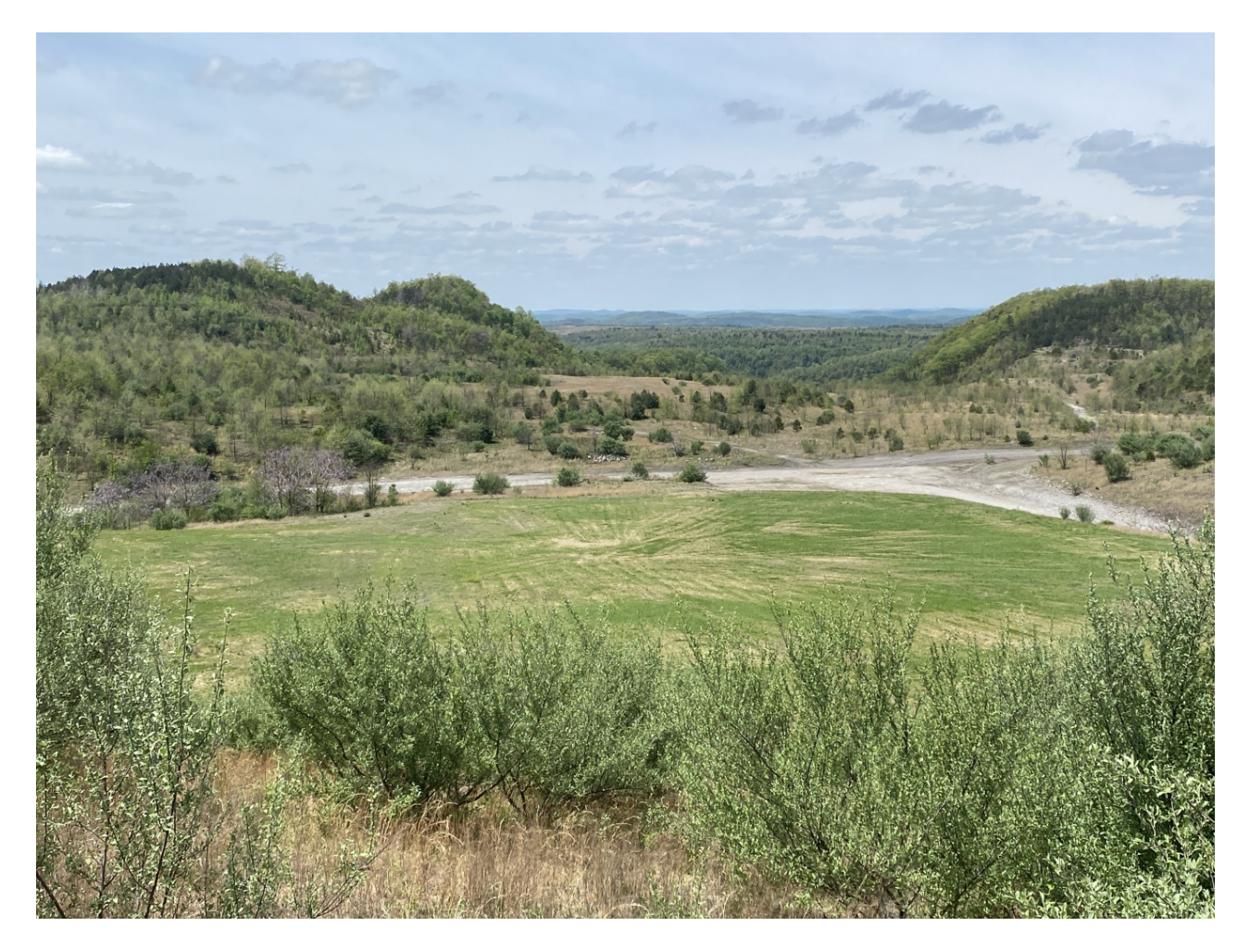
An area that can now be utilized for solar energy on the old Wildcat Mine in Nicholas County, WV

Location: Nicholas County, West Virginia