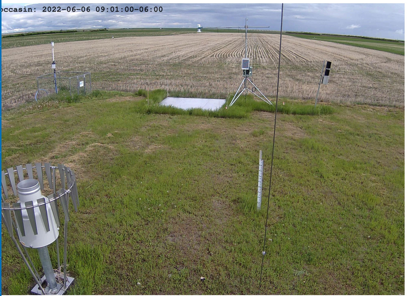
Montana Mesonet Moccasin Station, one of the newly retrofitted soil moisture and snowpack monitoring stations in the Upper Missouri River Basin project. Download Image